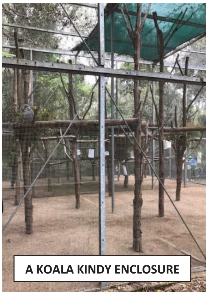
A KOALA KINDY ENCLOSURE