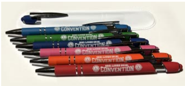
WESTERN CARNIVAL CONVENTION PENS WITH STYLUS $3.50 EACH OR 5 FOR $15