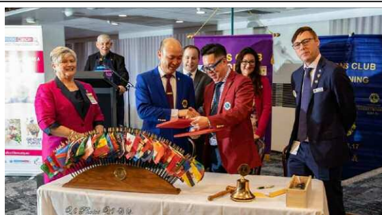
Brisbane United Asia Business