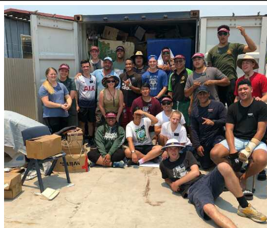
Apple Mac Users of QLD