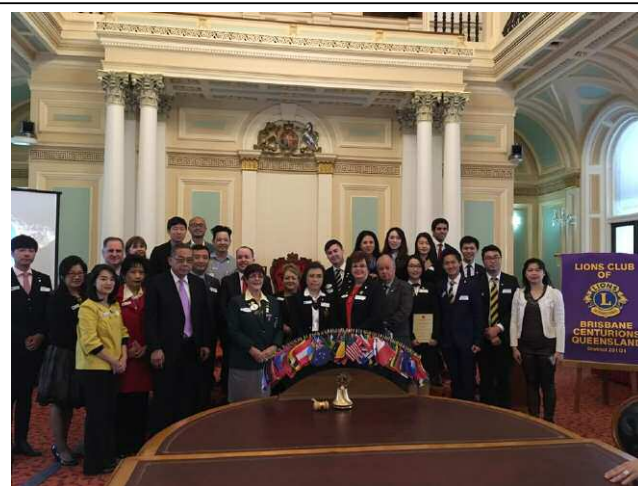
Brisbane Centurions Queensland