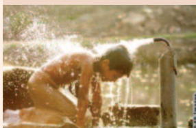
A bath at a public tap – Sri Lanka

Phone 07 3846 1584 or iantowers@optusnet.com.au